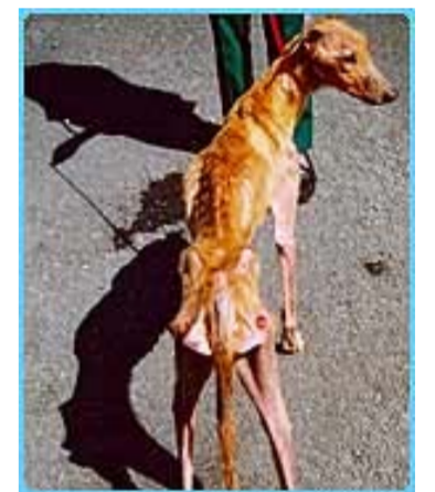
Sally: an starvation case from Devon.

Most of these dogs have only ever known a life inside kennels, being transported all over the country in the back of vans to race at different tracks and the roaring of the crowds at the racing stadiums.