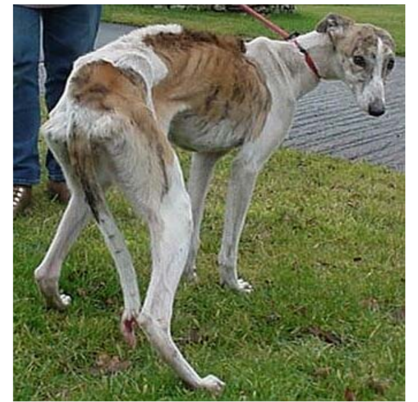
Twiggy: another starvation case from Devon. Now rescued.