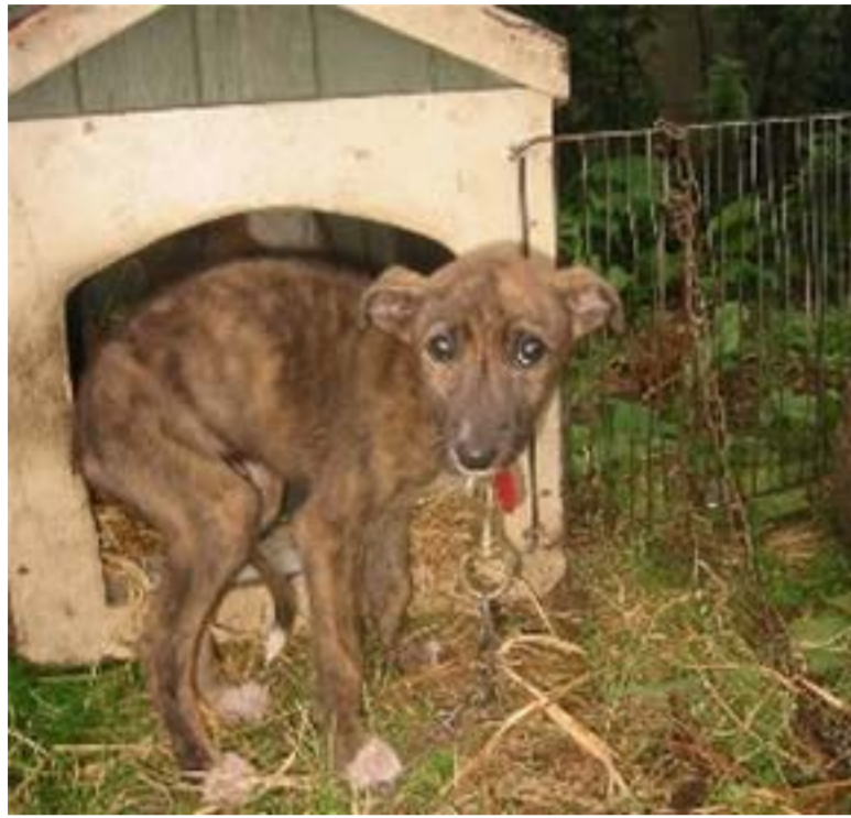
Shamie was rescued in Ireland at the age of 10 week

Not every dog bred for racing has got the qualities that the industry require. Thousands of greyhound pups and young dogs are put to death before they even reach the stadiums because they fail to reach the standards required for racing. If a dog is not fit, has not got the racing mentality, gets injured during training or is not of use to the racing industry, it is most likely disposed off.