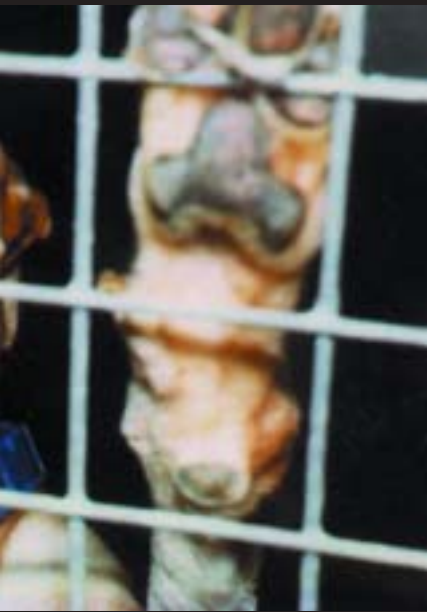
GREYHOUND RESCUE WALES